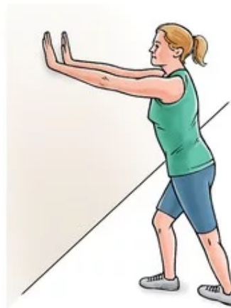
Standing calf stretch