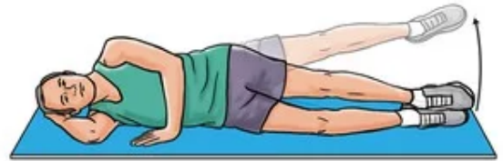
Side-lying leg lift