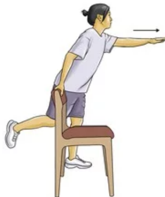
Balance and reach exercise A