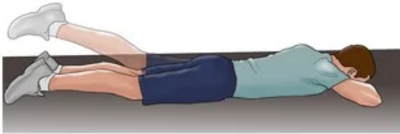
Prone hip extension