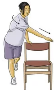
Balance and reach exercise B